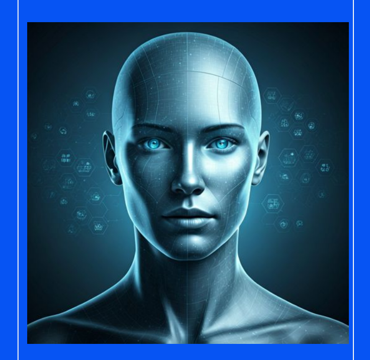
Google Gemini image. Prompt: Artificial intelligence and psychology