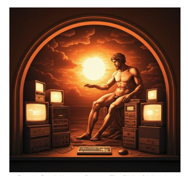
Google Gemini image. Prompt: The Birth of Adam but with computers.

Al systems are designed to do a huge number of things.