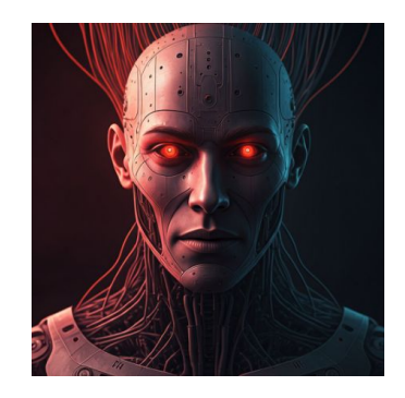
Google Gemini image. Prompt: Generate an image of scary Al